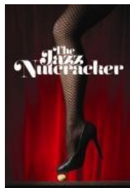
Jazz Nutcracker Dec 9 - 18