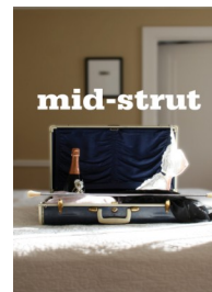
mid-strut Feb 2 - 19