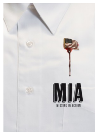
M.I.A. Mar 22 - Apr 7