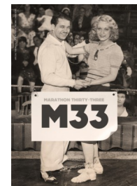
Marathon 33 Feb 23 - Mar 4