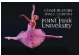
Conservatory Dance at PPU* Mar 2 - 4