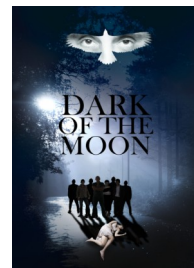
Dark of the Moon Apr 12 - 22