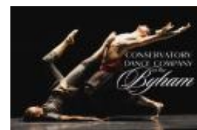
Dance at the Byham# Apr 19 - 21

By purchasing the GetGo Fuel & Fun Package, you will become a Playhouse Season Subscriber which gives you: the best available seats to the shows, a flexible ticket exchange policy and discounts on additional tickets. Plus you will have the opportunity to purchase season tickets to our 2012-2013 season before they go on sale to the public. Quantities are limited.